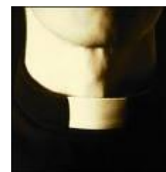
Seminarians at the Pontifical Scots College in Rome.